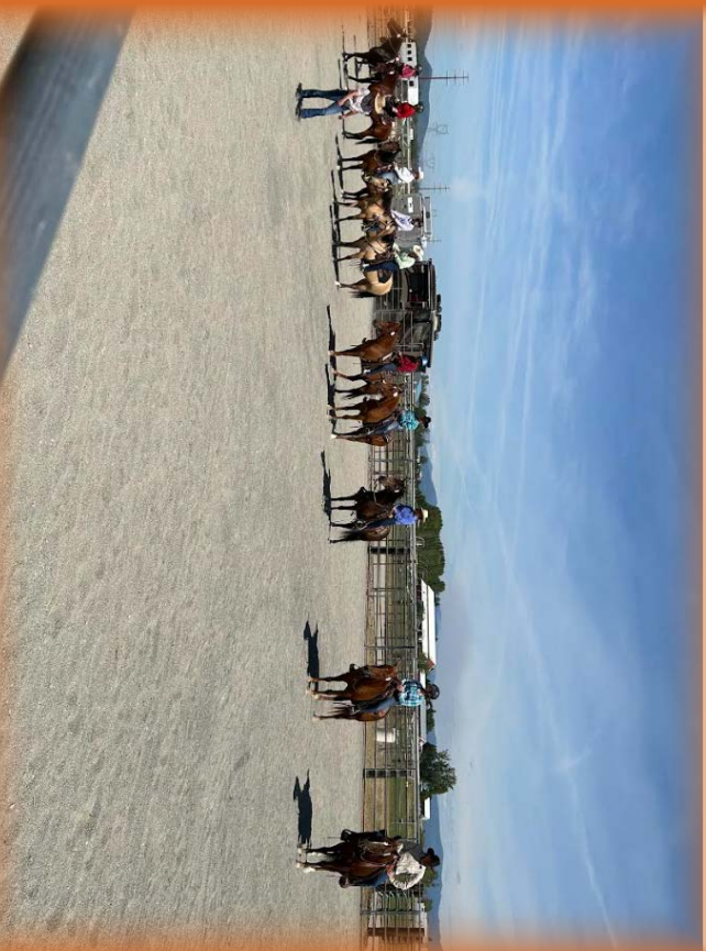
Blazer Horses showing at the 2023 Blazer Bonanza